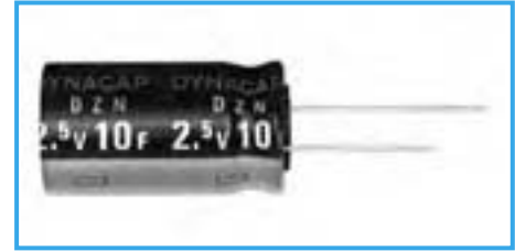
Marking color : White print on a blue sleeve